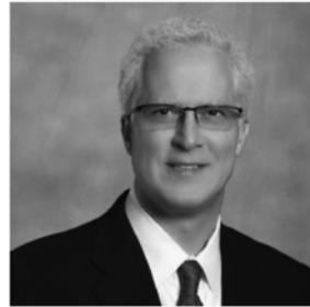
Specializing in Commercial Litigation, Family Law, and Trusts and Estates

The 42nd District Court has resumed in-person proceedings, with the exception of landlord-tenant cases which will be conducted virtually. In-custody matters will continue to be conducted remotely unless an in person hearing is necessary. Virtual hearings will be granted upon request. Hours of operation are 8:30 a.m. to 5:00 p.m. For your convenience, the court remains open during the lunch hour between 12:00 p.m. to 1:00 p.m. There is an after hour drop box located in front of the courthouse for any court documents or payments.