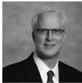
Specializing in Commercial Litigation, Family Law, and Trusts and Estates

The annual LRS subscription rate for Macomb Bar members is $200. Non-members pay $450 per year. Additionally, subscribers agree to share 15% of the revenue generated by the referral. As we close out the year we have 101 active lawyers participating in the program. Many of whom have been LRS panelists for 10 years or more. Which makes you wonder, why? My guess is the bar's LRS works for them.