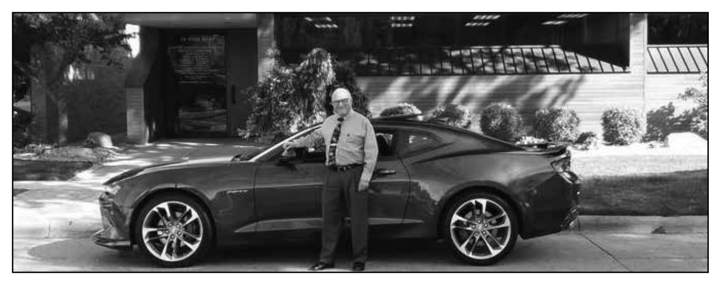
or, I will gladly drive to your office